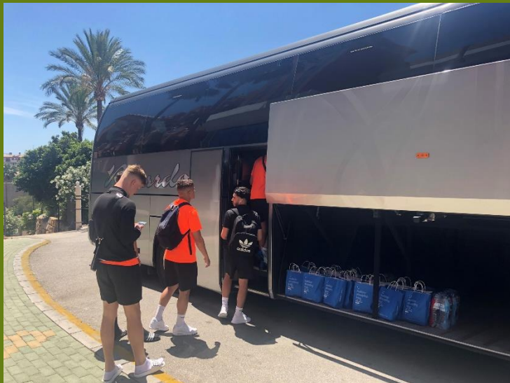
ALL GROUND TRANSFERS