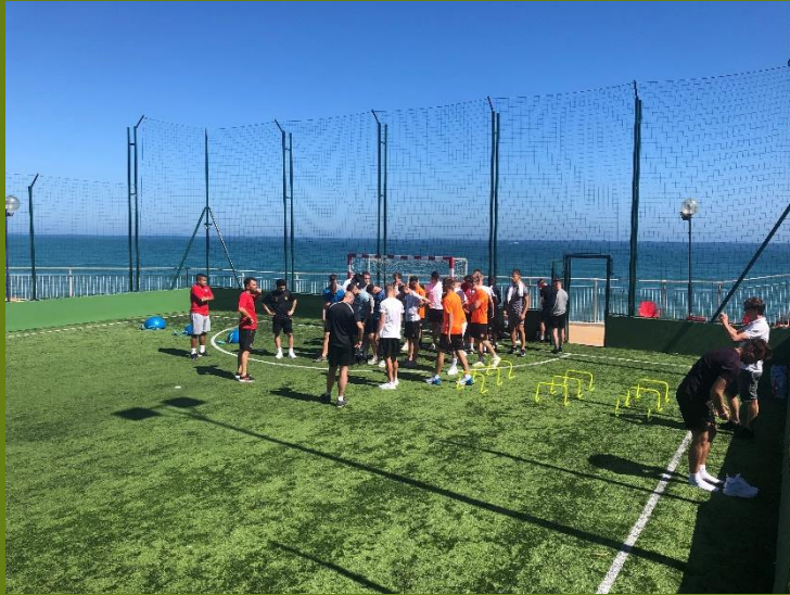
CROSS FIT TRAINING SESSION