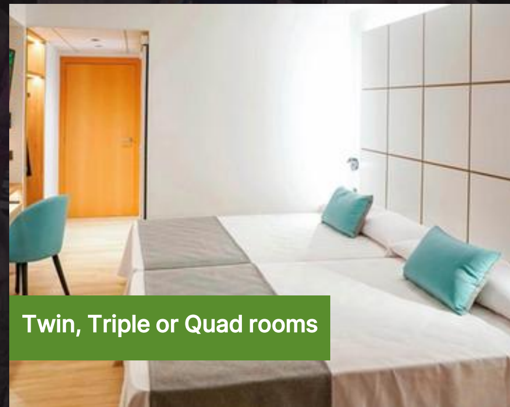
Twin, Triple or Quad rooms