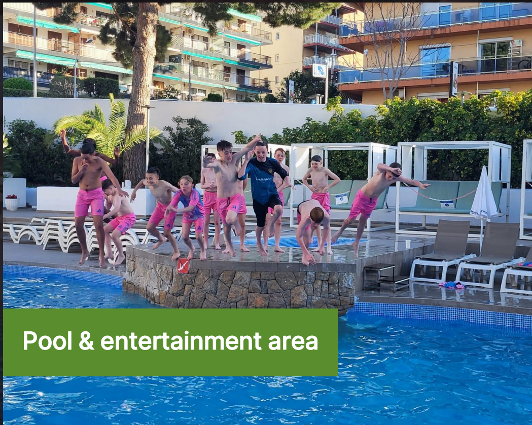
Pool & entertainment area